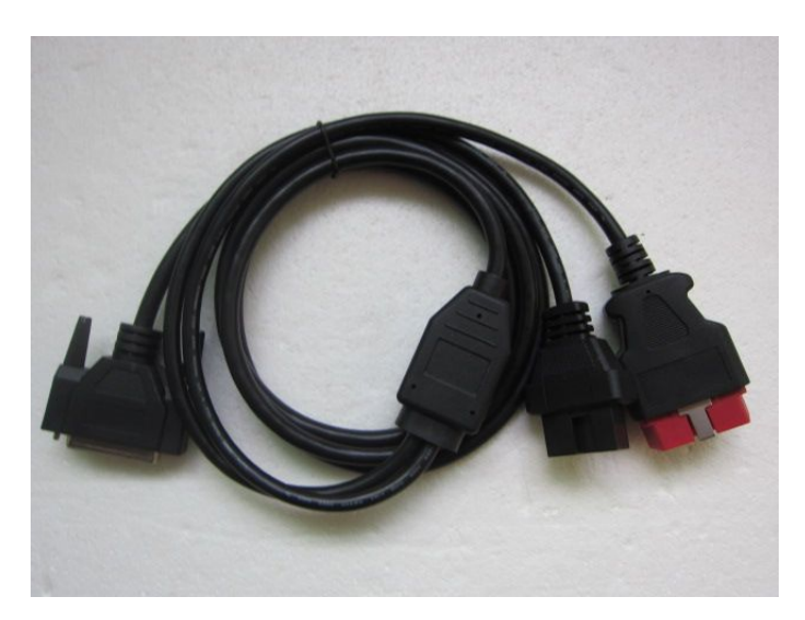
(5) M.U.T.-III BOX