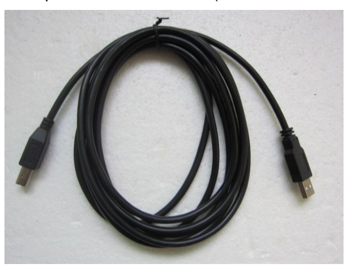
2)When used with the V.C.I. unit (disconnected from PC)