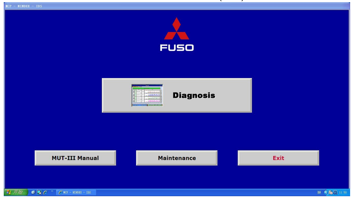
FUSO Diesel vehicles (truck ,bus)