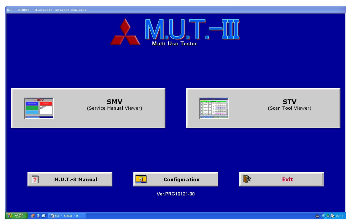
Mut-3 Gasoline vehicles (car)